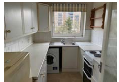
SECOND FLOOR 421 sq ft. (39.1 sq m.) approx.

OPEN SESSIONS – NO NEED TO CALL TO BOOK IN